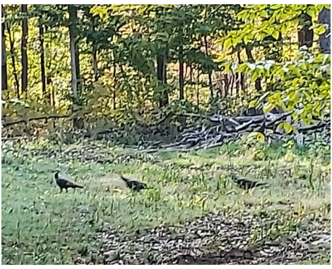
Disclaimer: Information obtained from sources deemed to be reliable. However, we make no guarantee, warranty or representation. Information, prices, and other data may change without notice.