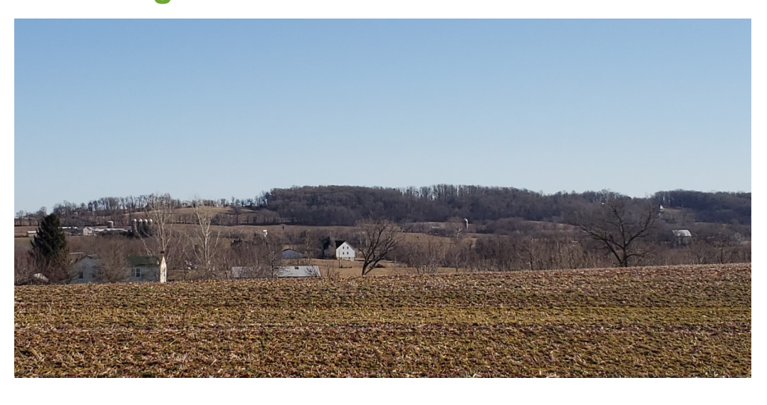
View to Northwest