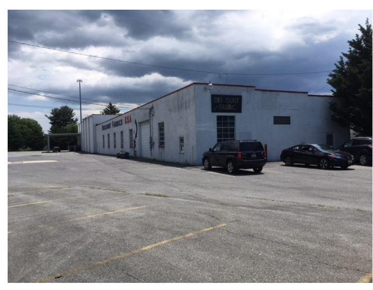
Disclaimer: Information obtained from sources deemed to be reliable. However, we make no guarantee, warranty or representation. Information, prices, and other data may change without notice.