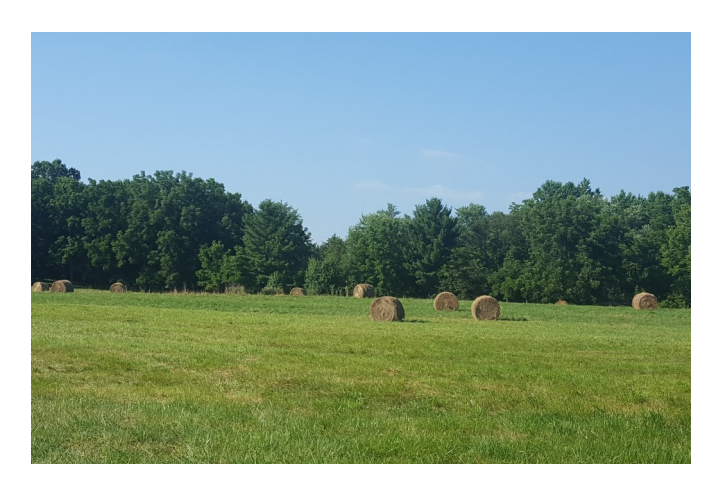
15 acres +/- of pasture or hayfield