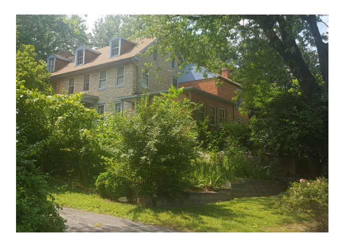
View of house from driveway