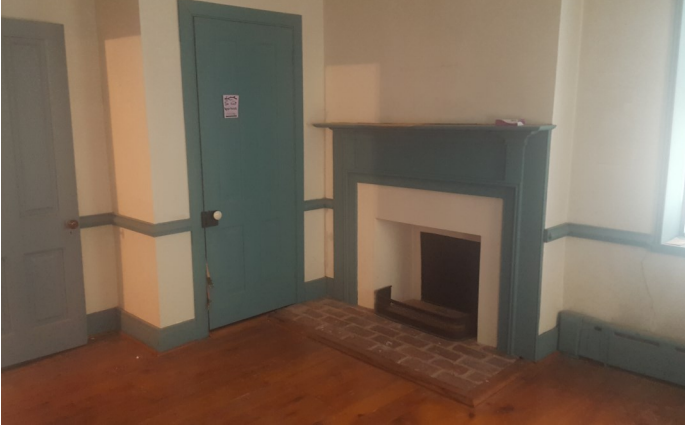
One of 3 BR's - 9' ceiling, pine floor etc.