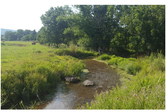
Carroll Creek bisects the Property