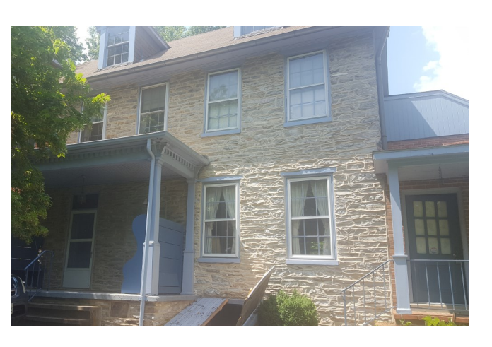
Original stone house - circa late 1700's