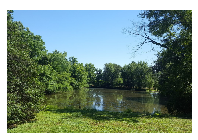
One half acre pond