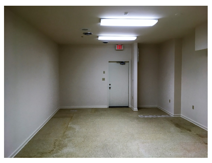
Disclaimer: Information obtained from sources deemed to be reliable. However, we make no guarantee, warranty or representation. Information, prices, and other data may change without notice.