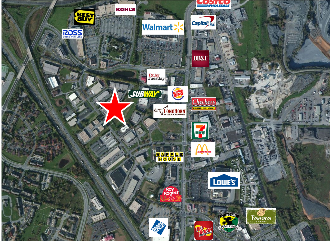
Disclaimer: Information obtained from sources deemed to be reliable. However, we make no guarantee, warranty or representation. Information, prices, and other data may change without notice.